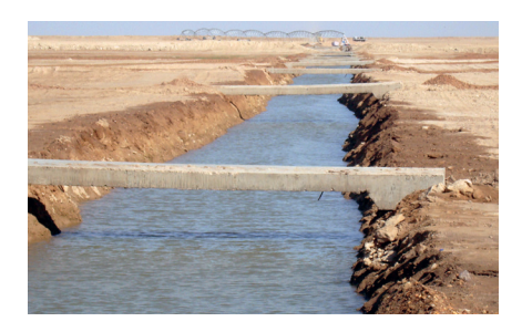
Artificial Canal with Bridges

Three PS21k pumps are positioned in parallel at the pivot's center to provide the necessary amount of water.