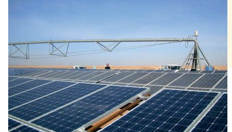
PV Array at Pivot Center

Nine wheel towers carry the pivot's weight and move it. To cross the water supply canal, simple bridges were built.