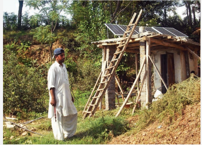
Khapal Kor Foundation: Orphanage in Swat installed 28/8/2011

Khapal Kor Foundation (KKF) was built in October, 1996 to accommodate the orphans of Malakand region. It is located in Swat near to the city of Mingora. The 3,500 orphans residing here are provided with free education and skills development to give them equal opportunities in society. APT team along with the UNDP team surveyed this site on 21/8/2011, the director of KKF was very excited about the solution.