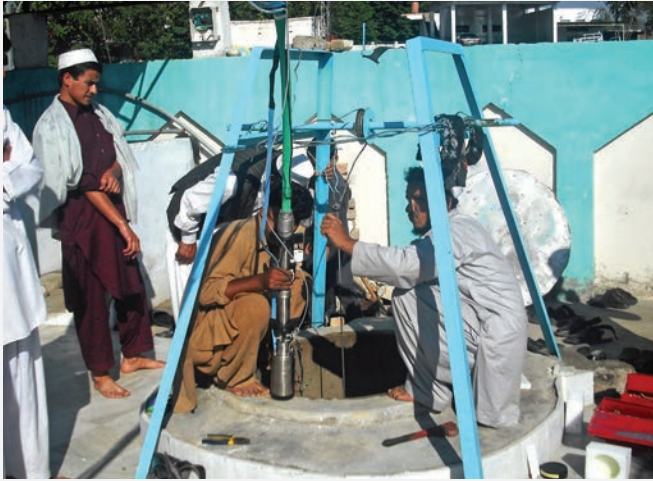
Koz Palao: Communal well in Swat installed 17/8/2011

Koz Palao is in the village of Shalpin located in the mountains of northern Swat. These villagers have acute water problems with long trips to collect water from a hand pumped well. This site was surveyed by UNDP team and considered as one of the most deserving places in this region.