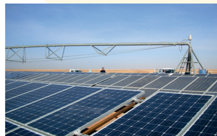
PV Array at Pivot Center

Nine wheel towers carry the pivot's weight and move it. To cross the water supply canal, simple bridges were built.