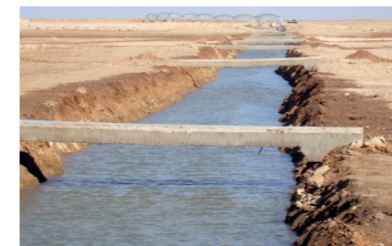
Artificial Canal with Bridges

Three PS21k pumps are positioned in parallel at the pivot's center to provide the necessary amount of water.