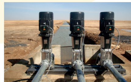
3 PS21k Solar Pump Systems

The solar array is placed at the pivot's center. This can allow the pivot to clean the solar panels once per turn.