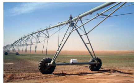
Pivot Wheel Towers

With the solar pivot pilot project being a great success, AE Photonics Maroc expects to equip several similar installations with LORENTZ solar water pumps in the near future.